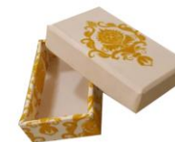
CHOCOLATE OR MINT BOX