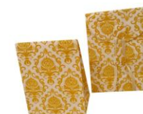
BUTTON TIE BAG